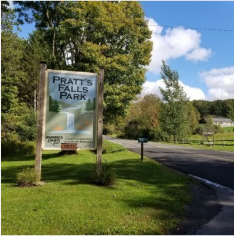
Pratt's Falls Entrance